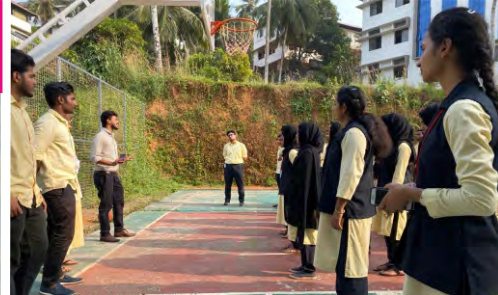
KMCT Medical College