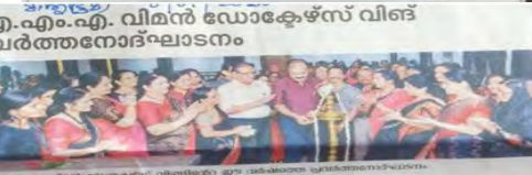
ഐ.എം.എ. വിമൻ ഡോക്ടേഴ്സ് വിങ് പ്രവർത്തനോദ്ഘാടനം