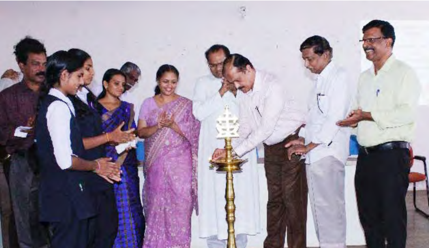
Inauguration of Pain & palliative unit at Bharata Matha College Alwaye in connection with World Cancer day