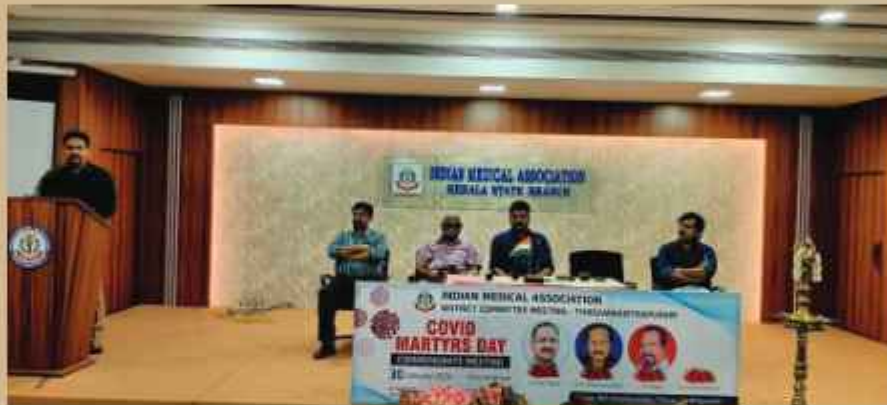
State Secretary attended the Covid Martyrs Day Commemoration Organised by Thalassery branch – 30.01.2024