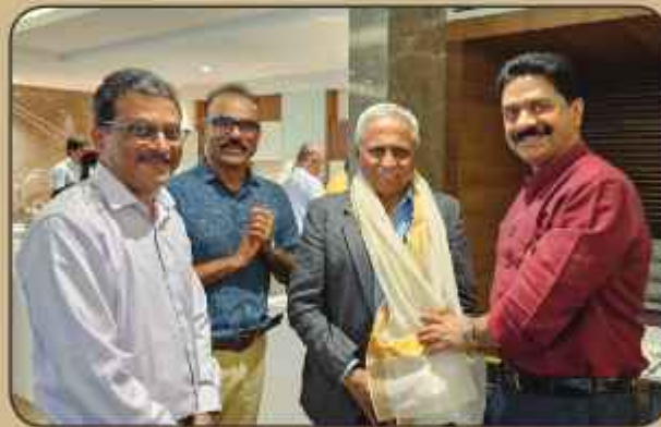
X' mas & New Year celebration IMA State HQ, Trivandrum – 06.01.2024