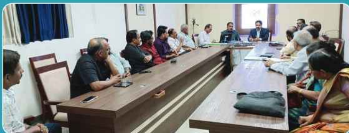
MEETING WITH KMPGA REPRESENTATIVES OF GMC, THIRUVANANTHAPURAMIMA STATE HQ, TRIVANDRUM - 12.12.2023