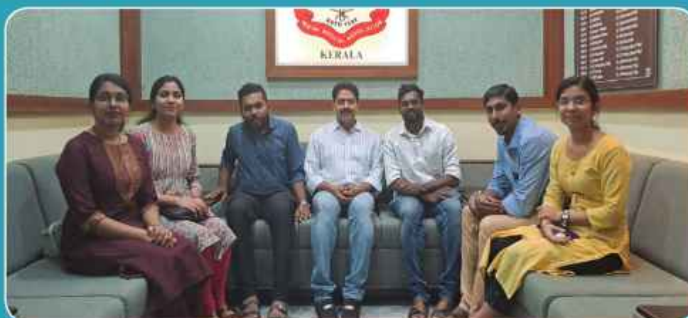
STATE PRESIDENT AND STATE SECRETARY WITH MSN GMC TRIVANDRUM - 13.12.2023