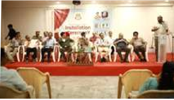
16.11.2025: Family get together for doctors.